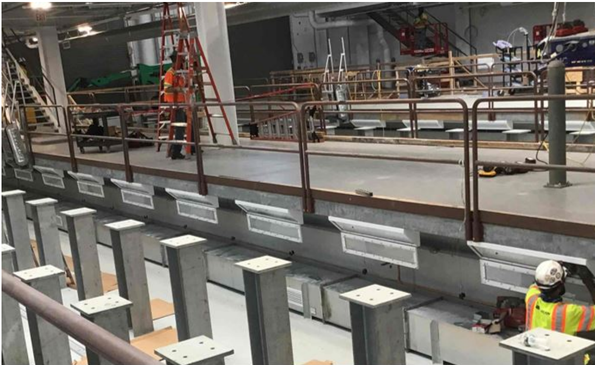
Area D Bay 2 Lighting Installation – Glenridge OMF