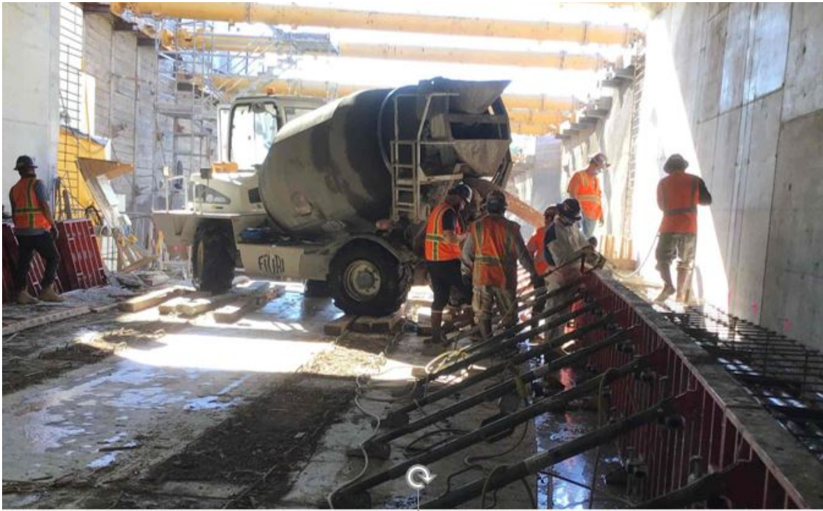
East Cut & Cover Safety Walkway – Arliss Street