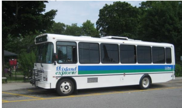
Island Explorer Shuttle