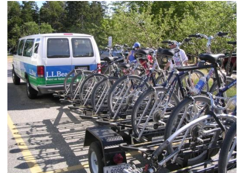
Island Explorer bicycle trailer

Location: Hancock County, Maine ( Rural Transit )