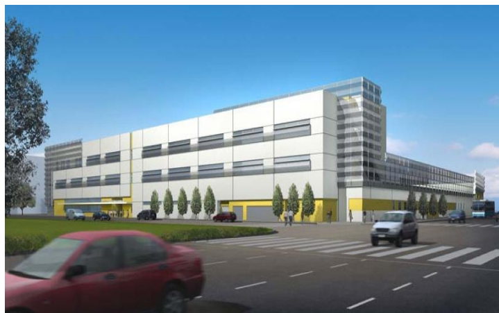
Wilshire and Vermont School