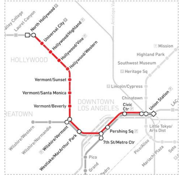
Red Line Station Map