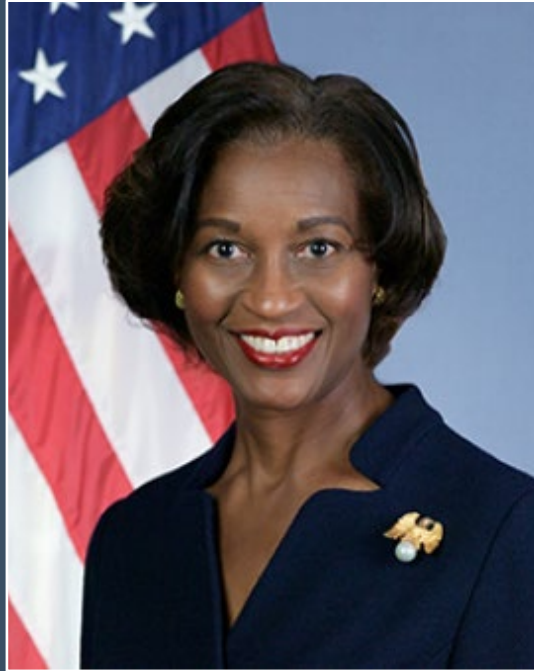
Nuria Fernandez Administrator Federal Transit Administration