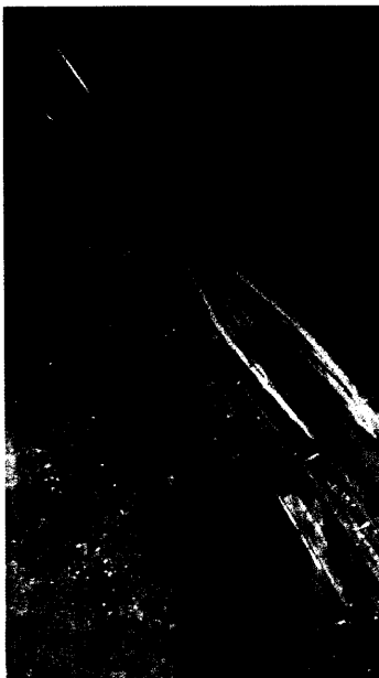
Figure 1 - F05 - 1B Frog Replacement