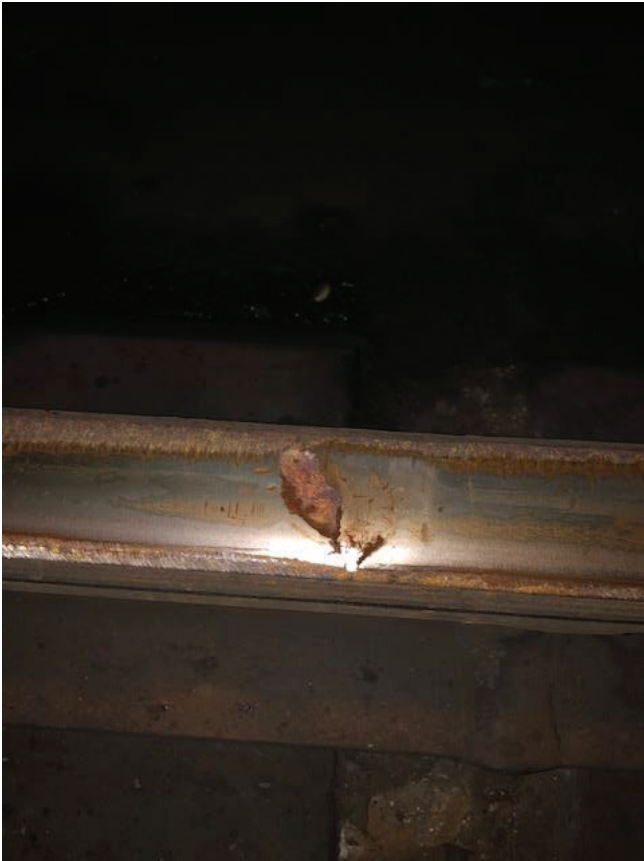
Figure 1: At D1 0085+85, on the right rail a chipped condition was observed.