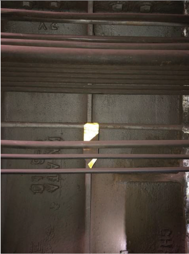
Figure 1: Between D04 and D05, all grab handles were behind wires and conduit.