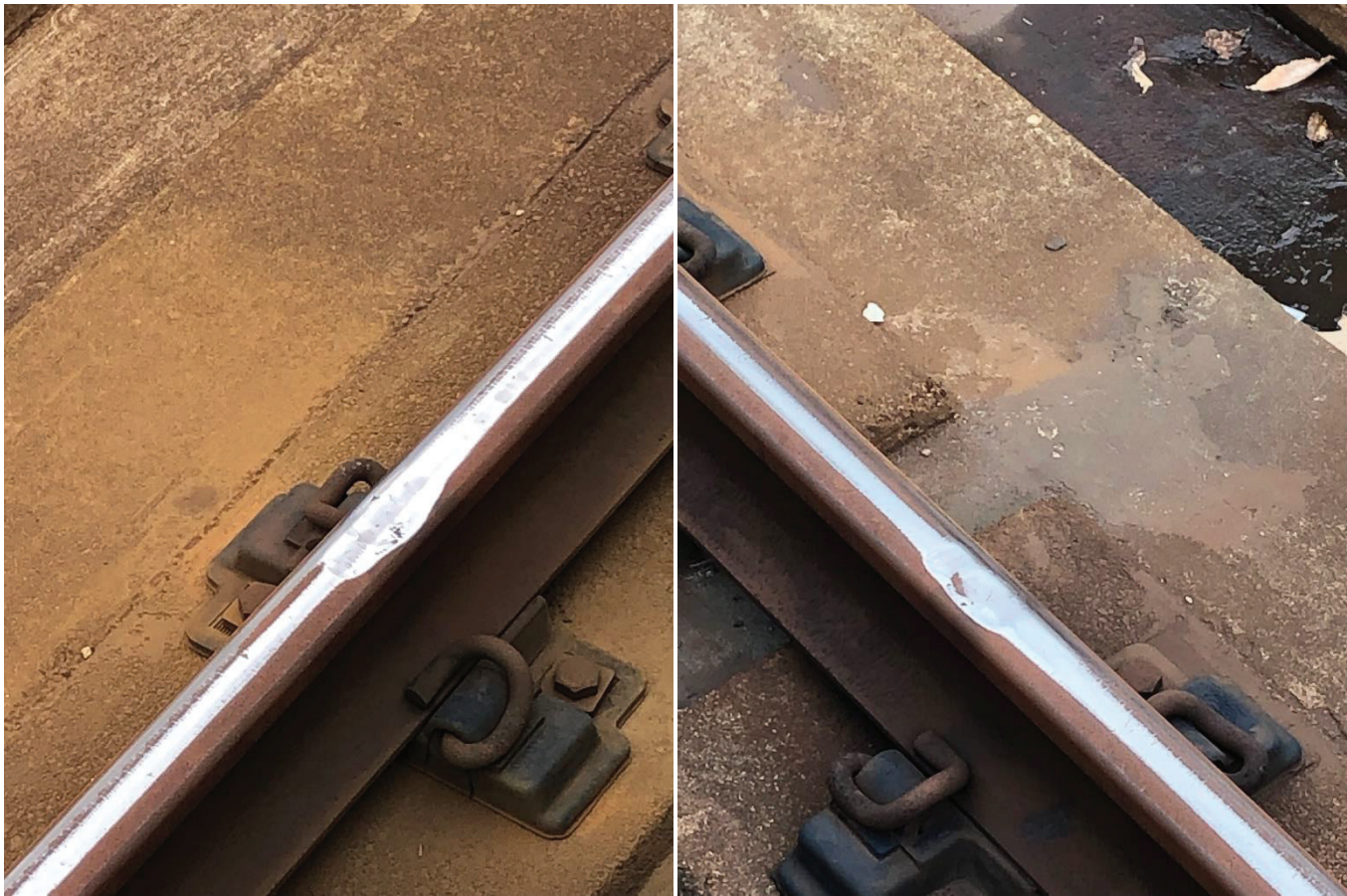
Figures 1 and 2: Engine burns near the 6-car marker on the right rail of track 2 at the West Hyattsville station.