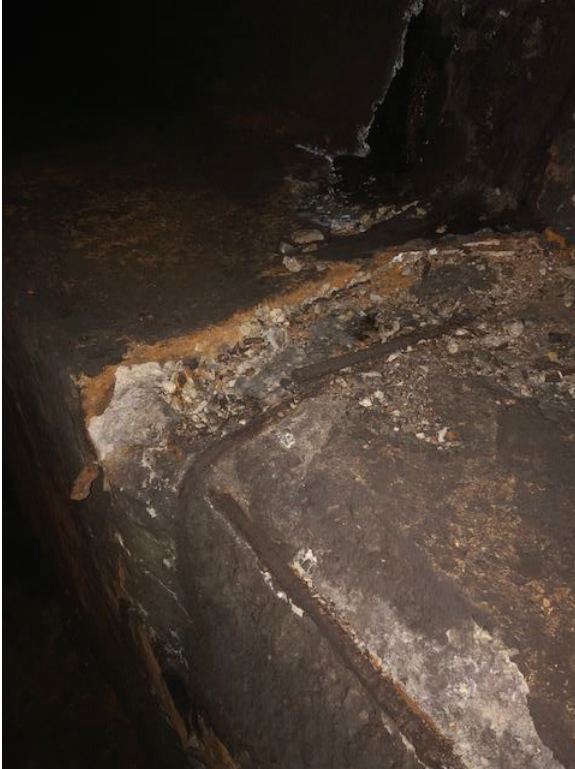
Figure 1: Catwalk at G1 431+70.