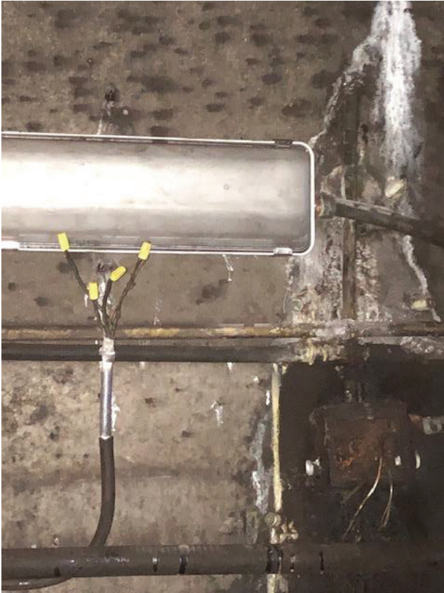
Figure 1: At A2 0358+10, exposed 110V wires.