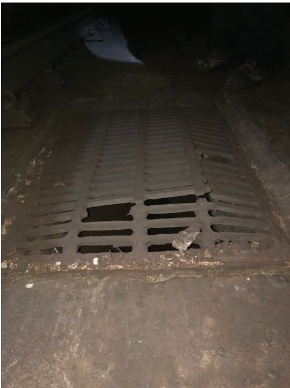
Figure 2: Center drain corroded and bent upwards at G1 449+30.