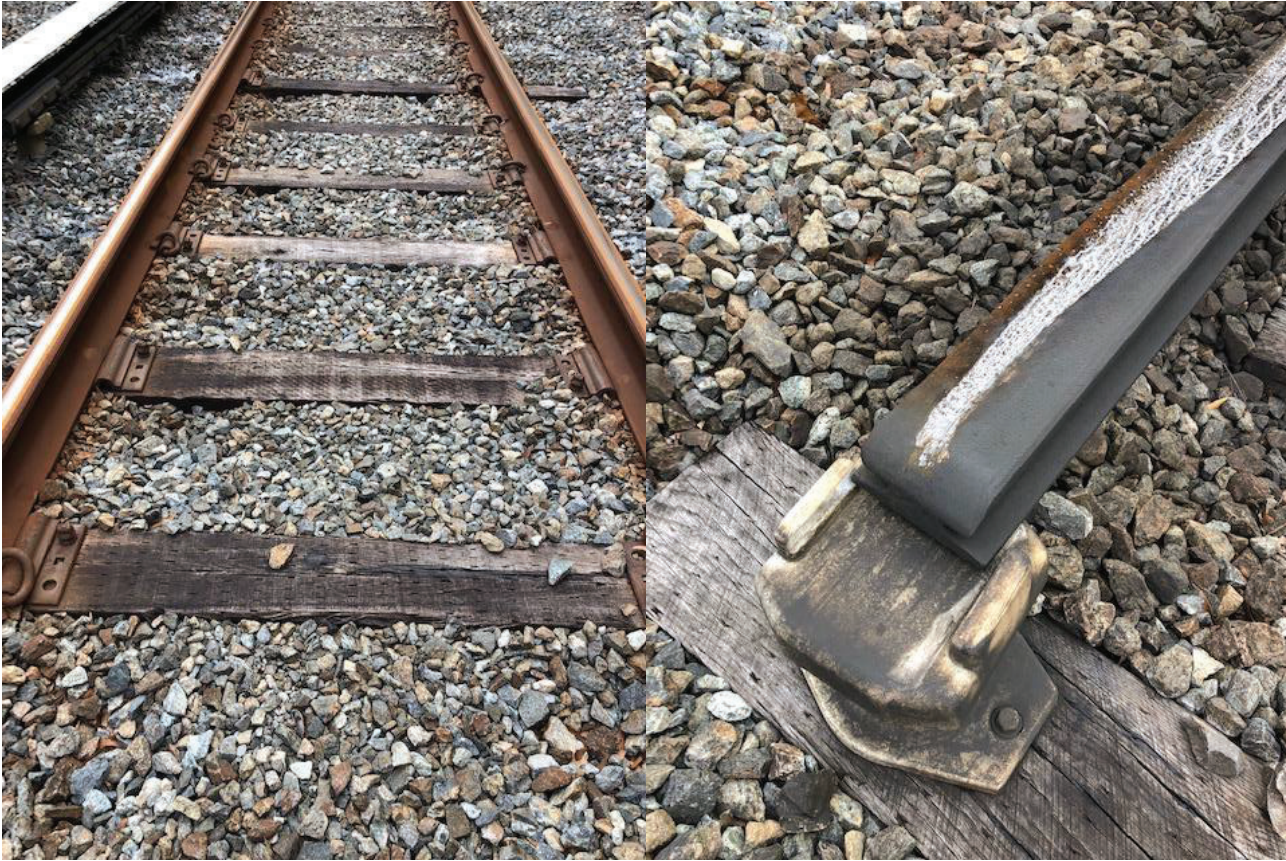
Figure 1: At A1 786+65, missing pandroll clips.