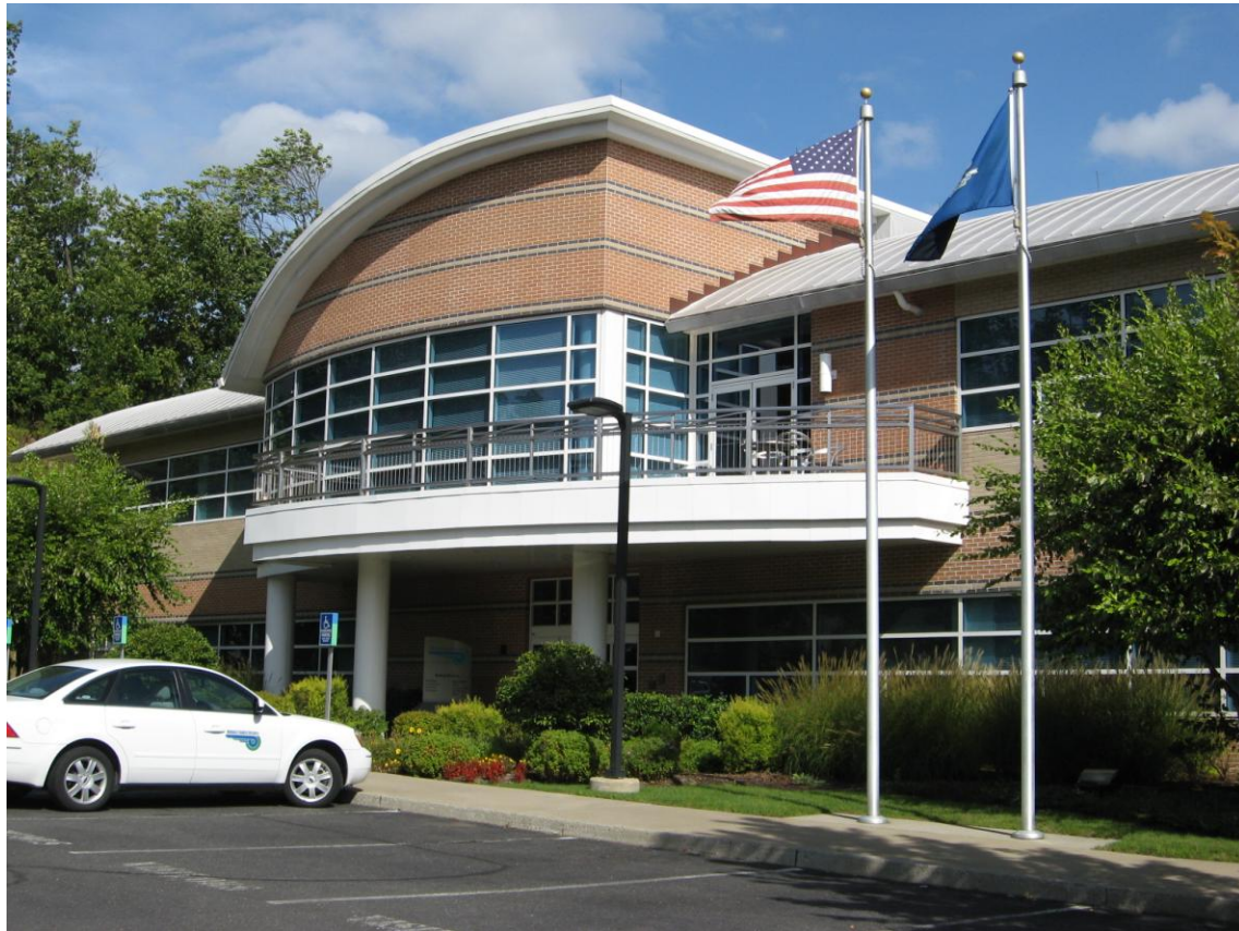
Norwalk Transit District