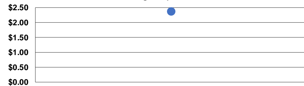
Operating Expense per Vehicle Revenue Mile: Agency Total